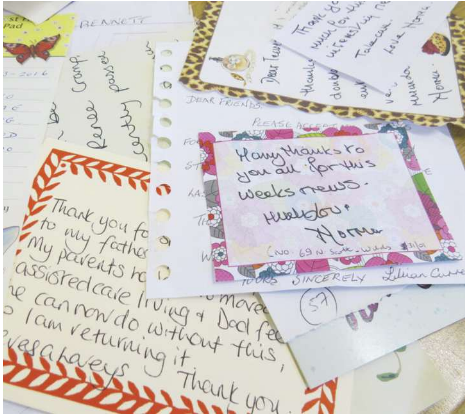
Thank you letters

On Friday morning another two volunteers arrive, and their job is to copy the recording onto the 80-odd sticks, 24