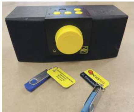
Memory sticks and player

at a time, before placing them in the labelled provided pouches, before posting them all out.